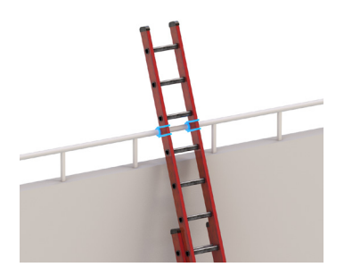
Figure 11 Correct - tying near the base