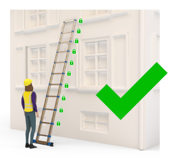
Figure 5 Check all sections are locked before using the ladder

Before every use – in addition to the normal ladder checks – make sure they are operating correctly and that the mechanisms that lock each section are working properly.